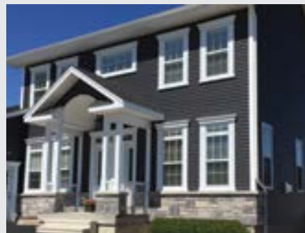
Vinyl Siding and Accessories