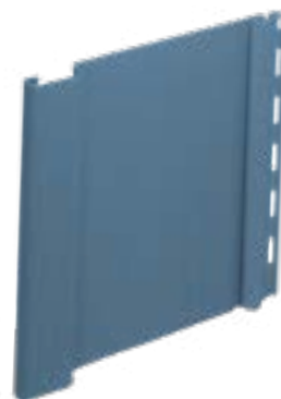
Board & Batten