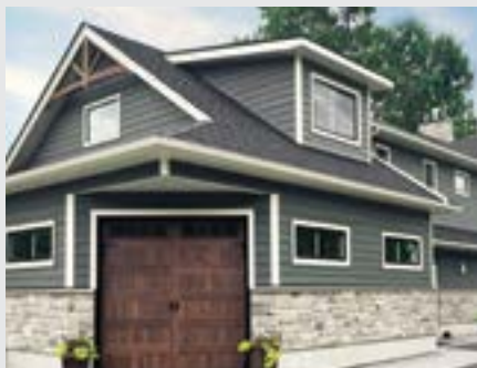
Engineered Wood Siding and Accessories