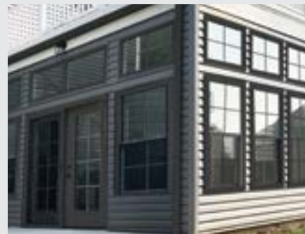
PVC Windows and Patio Doors

We not only have the products to create your dream home but we also have the tools to help you design it.