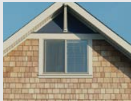
Polypropylene Shakes and Shingles