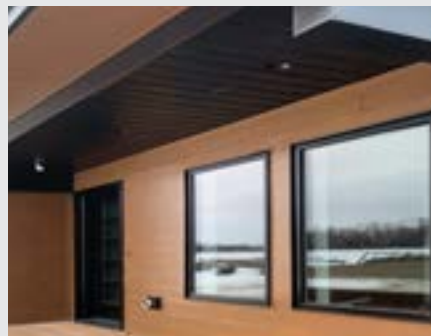
Aluminum Siding and Accessories