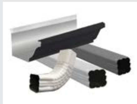
Vinyl and Aluminum